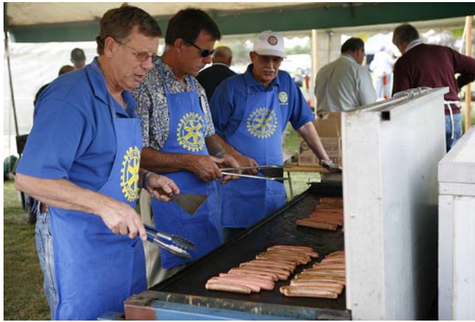
With (more than) a little help from our friends. The four Rotary Club of the Moira Shire support the Boroondara Cares program. (Fourteen Rotary Clubs were represented at Katunga.)

It was decided on the recommendation of the Moira people that notwithstanding programs that might come later, the immediate need was for a demonstration of concern for and solidarity with the Moira Community. This would be achieved by the mounting of a community event, a free barbecue, for the community. This event to be mounted by a joint effort between the Rotary Club of Camberwell and the four Rotary Clubs of Moira Shire would be attended by